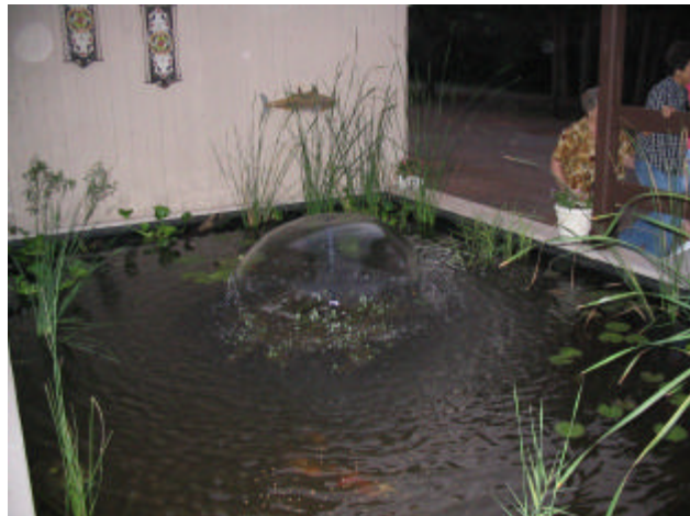
These pictures were taken during the pre tour. Robert & Beth Lowry's Garden